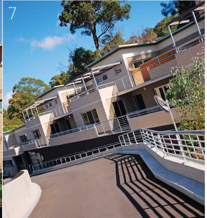
— BLAKEHURST AGED CARE FACILITY 96 BED LOW CARE FACILITY + REFURBISHMENT OF EXISTING BUILDING FOR THE INCOLL GROUP