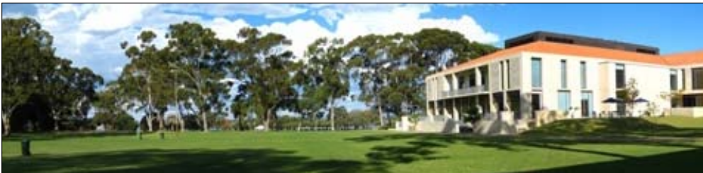
The University Club of Western Australia Perth venue for the Australian Applied Management Colloquium

The Australian Applied Management Colloquium is designed for frontline and mid-level managers and team leaders with direct accountability for the performance of other staff. The program is also appropriate for individuals who aspire to progressing within their organisation to future leadership roles.